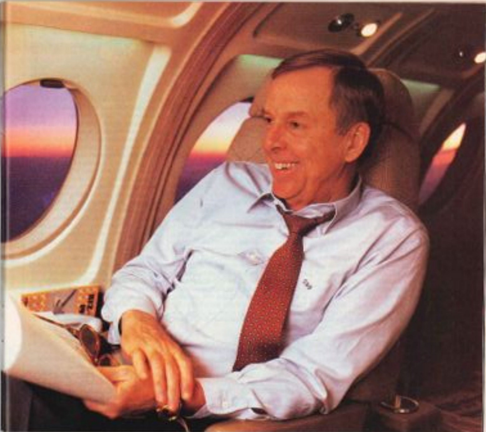
Jet as the eve of the surprise announcement of his latest move, an investment of nearly $600 million in Unocal. "We're the biggest shareholders!"

Some shareholders welcome Pickens because he has jacked up stock prices to dramatically higher levels. He estimates that as a result of his takeover battles, about 750,000 small investors have seen the value of their holdings grow by about $12 billion. His pursuit of Gulf, for example, pushed that company's stock from $41 a share in October 1983 to the $80 that Chevron agreed to pay for it in March 1984.