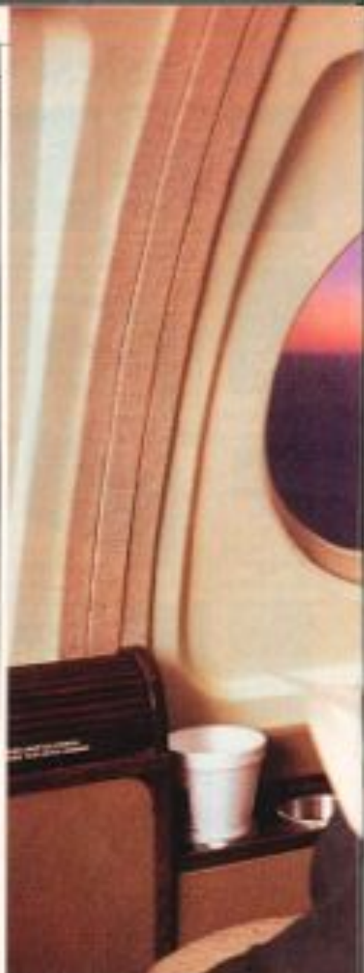
Heading toward New York City aboard his Falcon 50

The Texas oilman has roused his vast payoffs through the mastery of the takeover battle, a colorful form of corporate warfare fought with dollars, stock and shareholder votes. The campaigns are as vivid as the terminology of their tactics (see box). A takeover raider typically launches his attack by buying a significant percentage of a firm's stock and offering to pay other shareholders more than the current market level for their securities. The goal is to get enough shares—typically 51%—to win control of the company and the ability to run it. Management and the raider frequently get into open warfare through expensive mailings and full-page ads in newspapers in which they disparage their opponents and appeal to stockholders. Eventually shareholders have to decide whether they want to support the current management or the raider.