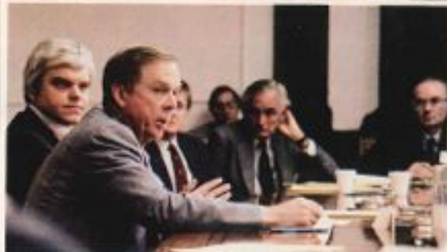
Explaining and defending his tactics at a Manhattan conference of major institutional investors.

award-winning mathematician), with whom she likes to hunt quail. A skilled homemaker, she is also deeply interested in her husband's work. The year they were married, 1972, she enrolled in a geology course at Amarillo College and earned an A.