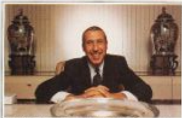
Boesky: a pilot fish gobbling the million-dollar stray morsels

Sometimes he is wrong. When Phillips Petroleum struck a deal to buy off the raiding T. Boone Pickens in December at a lower than expected price, the firm's stock plummeted and Boesky lost an estimated $40 million in less than a week. Nonetheless, he maintains that he is correct 90% of the time. "This is not some kind of gambling exercise," he says. "It's a