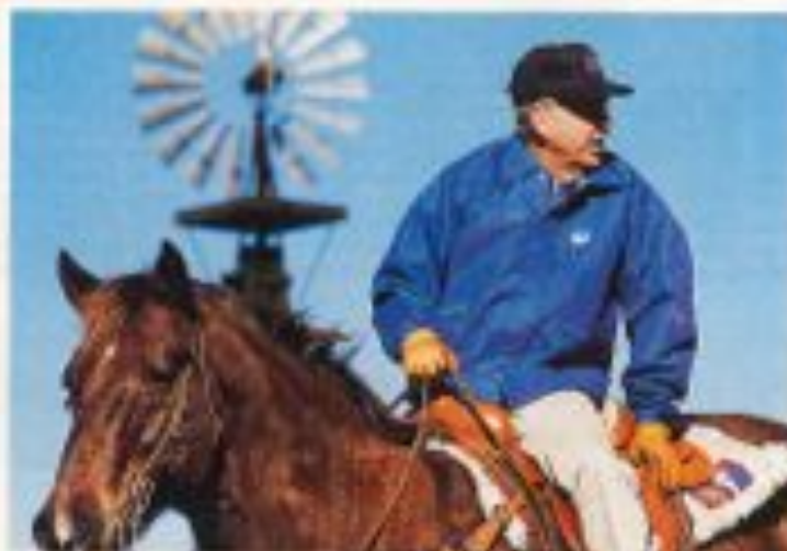
Riding the range at his 2B Ranch, a 14,000-acre spread in the Panhandle

of gambling. During the 1982 battle for Cities Service, he took time out to put $100 on a horse named Estoril, a three-year-old, 9-to-1 shot that he had been told was a sure thing in that year's Belmont Stakes. Estoril finished seventh in a field of eleven. Pickens had better luck last January, when he won $5,000 on the Super Bowl.