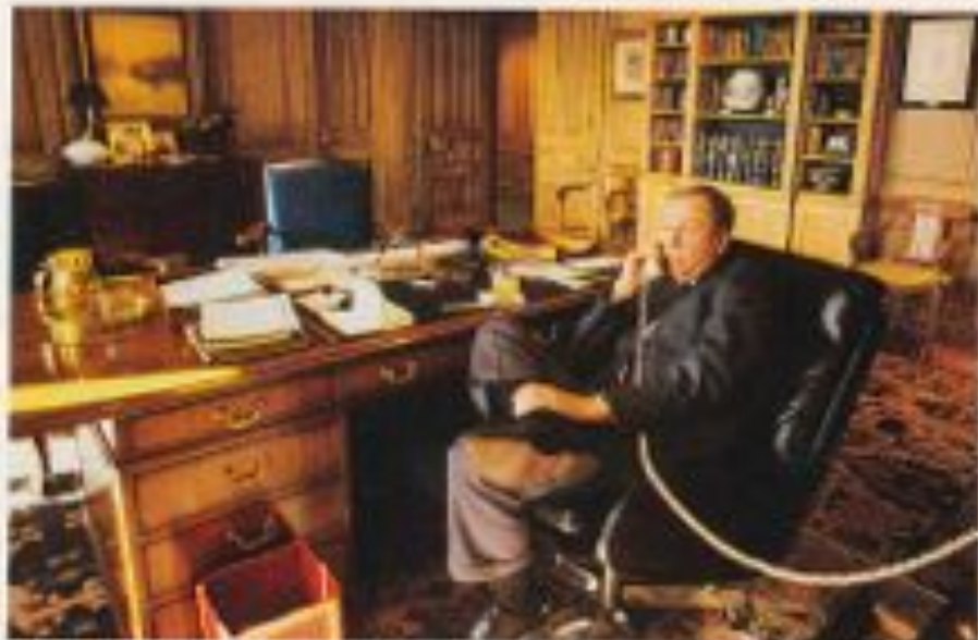
Talking takeover in his Mesa office in Amarillo and making waves all the way to Wall Street